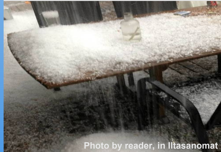
Karjaa, July 2013