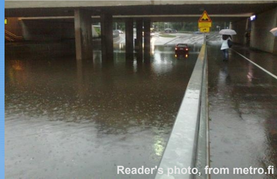
Central Helsinki, August 2011

ILMATIETEEN LAITOS METEOROLOGISKA INSTITUTET FINNISH METEOROLOGICAL INSTITUTE